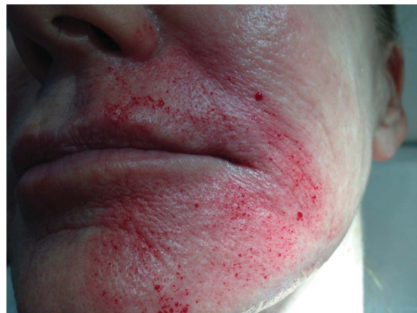
Figure 2. Pinpoint bleeding serves as a guide to indicate treatment end point.

example, when treating the perioral region, the left upper, left lower, right upper, and right lower regions can be treated individually for more precise and uniform microneedling coverage. Gentle traction of the skin with one hand while simultaneously lowering the microneedling device perpendicular to the skin with the other hand assists the smooth delivery of microneedles into the skin (Figure 1). It is important to apply sufficient hyaluronic gel (supplied by the device company) on the treatment area surface to facilitate the gliding action of the microneedling device and to prevent untoward injury to the overlying epidermis. The treatment technique involves a combination of horizontal, vertical, and oblique device passes over the treatment areas, repeating approximately 3 to 6 times or until fine pinpoint bleeding is observed (Figure 2). When treating deep rhytides or scars, a “rocking” or