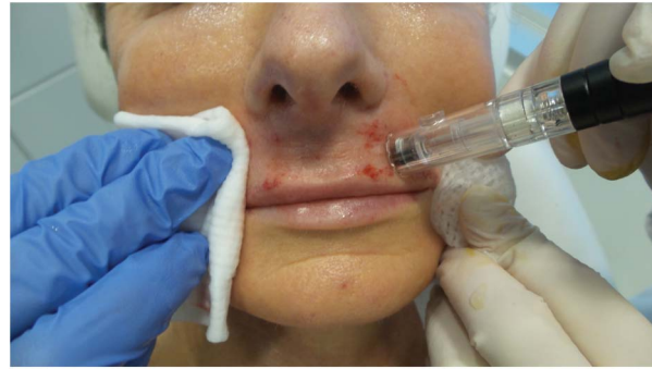
Figure 1. Microneedling device is placed perpendicular to the skin's surface with a thin layer of hyaluronic acid gel. Manual skin traction facilitates smooth gliding of hand-piece and uniform delivery of microneedles across the skin.

Depending on the specific location to be treated, it is often helpful to divide the region into quadrants. For